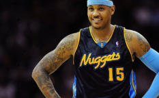
sl.com Carmelo Anthony's Viral Tweet After Denver Nuggets Win Champion... Carmelo Anthony sent out a tweet after the Denver Nuggets won th... NBA Championship.